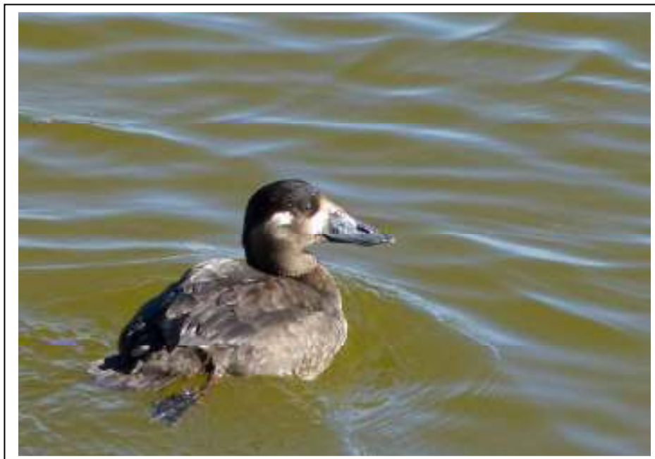
Surf Scoter

Cold temperatures cause the water to freeze in many wetlands which lead to concentrations on open water areas, like the Salt Creek, Ogden Bay, and Farmington Bay Waterfowl Management Areas, Bear River Refuge, and East Canyon Reservoir that provide additional viewing opportunities for many duck species. I hope you will take some time this winter to visit a body of water or wetland area near you to enjoy the many duck species that visit the area during winter.