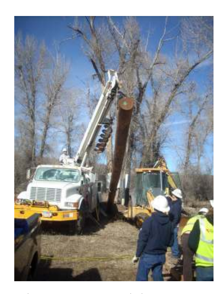
Rocky Mountain Power, DWR and others erecting a nesting platform.