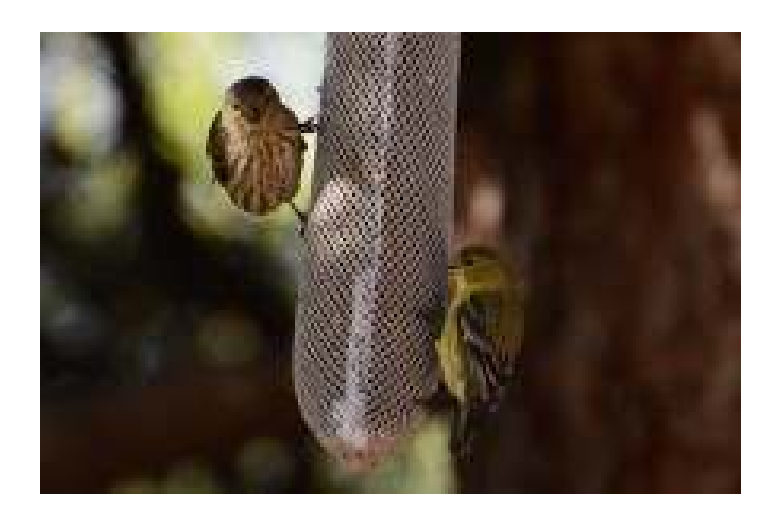
Pine Siskin (left) and Lesser Goldfinch at Nyjer sock.

About a month ago we ran out of nyjer seed, and I decided not to invest in another bag if I was only going to feed a couple weeks more. My husband had other ideas! He said, "Wait, let's keep feeding them; they are just starting to get their bright colors to photograph." Our nyjer feeder gets mostly Pine Siskins, and American and Lesser Goldfinches. And yes, the finches are molting into beautiful, lemony breeding plumages. There is no right or wrong time to stop feeding the birds. Your local flock will love it if you feed all summer, and there is nothing cuter than when the fledglings come to the feeder with their parents for the first time. And you never know, you might not be the only one in your house or neighborhood who enjoys the birds at your feeder.