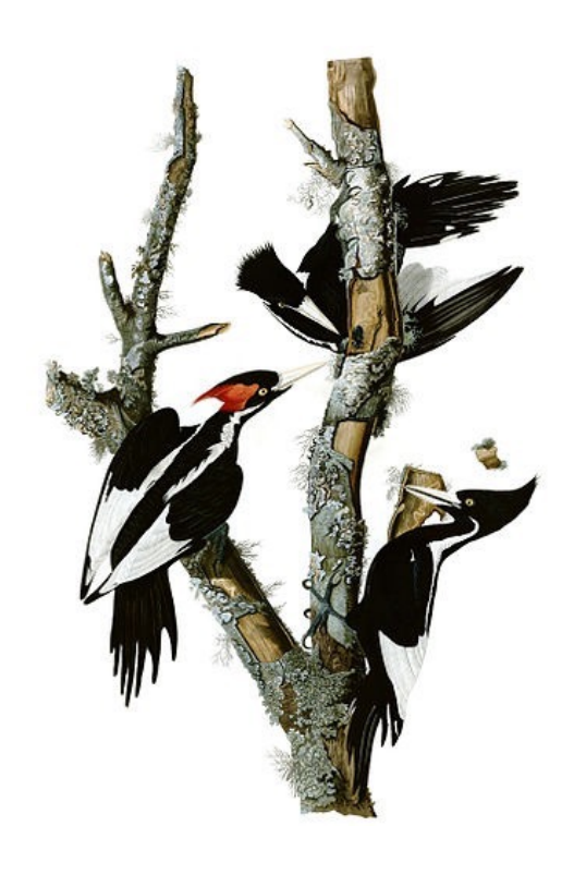
Ivory Billed Woodpecker Painting by John James Audubon